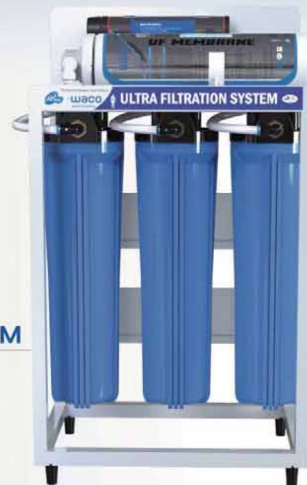
ULTRA FILTRATION SYSTEM Commercial 5 or 6-Stage UF System