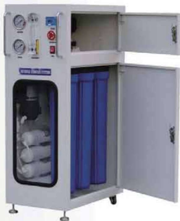
900GPD RO Commercial 5 or 6-Stage RO System 900GPD