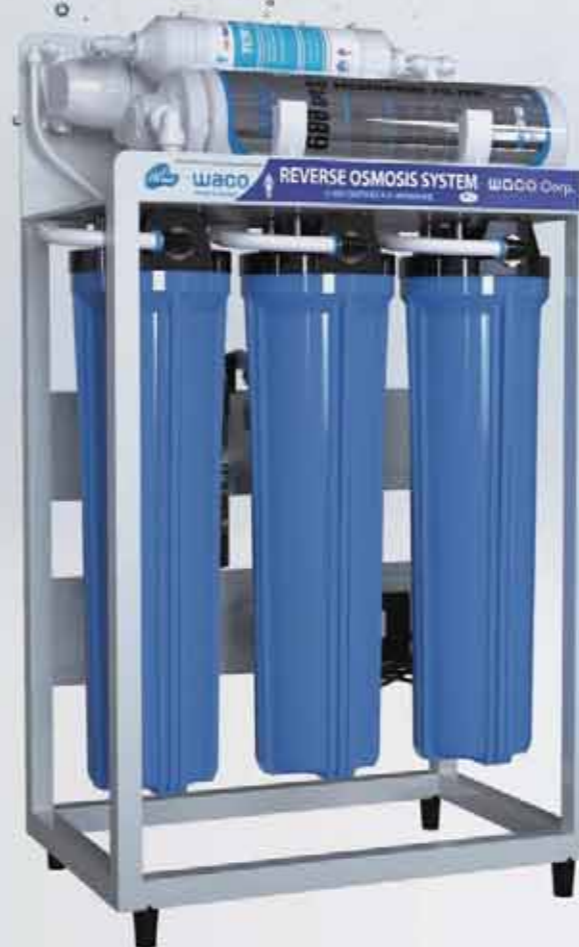
300GPD RO Commercial 6-Stage Stand type RO System 300GPD