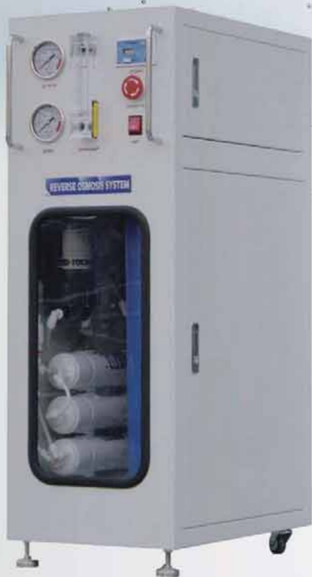
600GPD RO Commercial 5 or 6-Stage RO System 600GPD